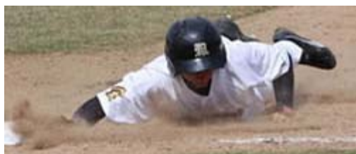
When's the last time you touched bases with Spartan Athletics?

Turmoil in the markets is affecting Manchester College in two significant ways ... more